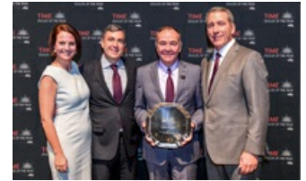
CLICK IMAGE FOR HIGH RES VERSION