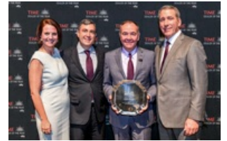
CLICK IMAGE FOR HIGH RES VERSION